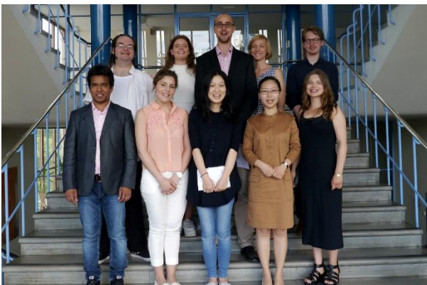
Graduating students in the Master of Science in Public Health. June 2016.

The beginning of 2016 saw 16 students enrolled in the 2014-2016 Master's programme. Thirteen students completed their thesis in the spring, and twelve students fulfilled the criteria to be awarded a Master of Science in Public Health from Stockholm University.