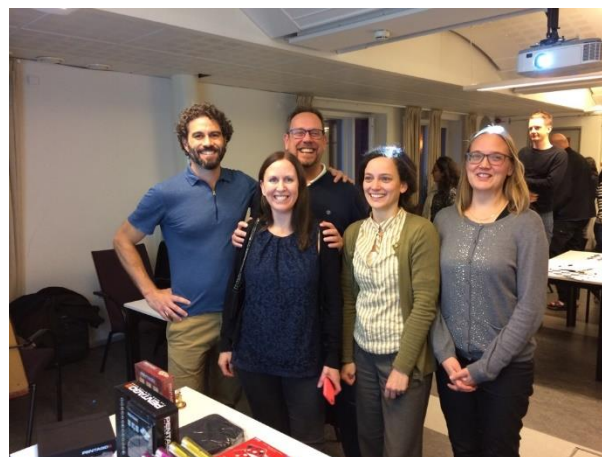
At the annual staff conference. October 2016.

Staff meetings were scheduled every third week during the autumn and spring term. The chair position rotated between the meetings.