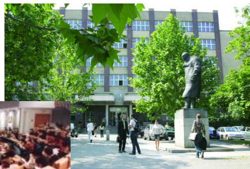
Main Campus Prague, Žižkov