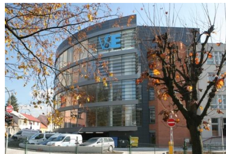
Campus Jindřichův Hradec , South Bohemia