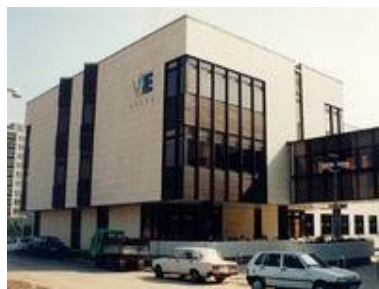
Campus Prague, Jižní Město