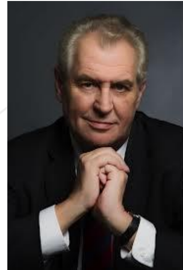
Miloš ZEMAN President of the Czech Republic