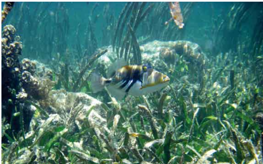
Thalassia hemprichii with Enhalus acoroides in the background, Kosrae, Federated States of Micronesia.

Seagrasses are submerged marine flowering plants forming extensive meadows in many shallow coastal waters worldwide. The leafy shoots of these highly productive plants provide food and shelter for many animals (including commercially important species, e.g. prawns), and their roots and rhizomes are important for oxygenating and stabilising bottom sediments and preventing erosion. The monetary value of seagrass meadows has been estimated at up to $19,000 per hectare per year, thus being one of the highest valued ecosystems on earth.