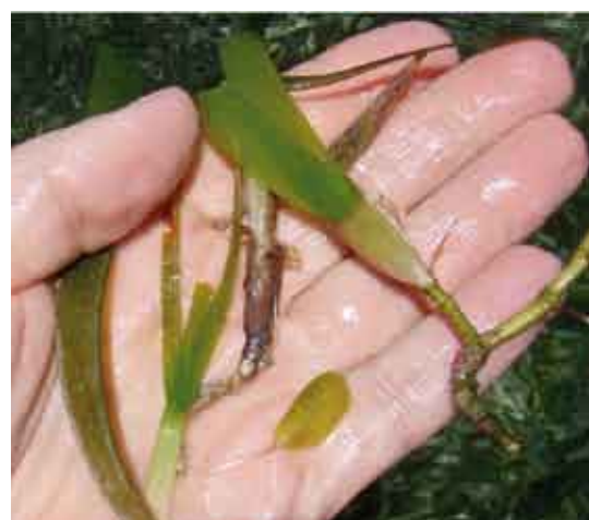
5 seagrass species, left to right: Enhalus acoroides , Cymodocea rotundata , Thalassia hemprichii , Halophila ovalis , and Cymodocea serrulata in Palau.

seagrass shoots vary from long, thin or strap-like leaf blades (up to 3 m long) to small, rounded paddle-shaped leaves (less than 1 cm long). The vegetative growth patterns of lateral branching and new shoot production often create dense meadows that form a canopy over the marine sediment. The plants’ structure, as well as the height of the canopy and the extent of the