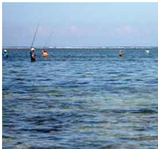
Fishermen in seagrass, Bali, Indonesia.

Seagrasses have had many traditional uses (cf. Terrados and Borum, 2004). They have been used for filling mattresses (with the thought that they attract fewer lice and mites than hay or other terrestrial mattress fillings), roof covering, house insulation and garden fertilisers (after excess salts were washed off). They have also been used in traditional medicine in the Mediterranean (against skin diseases) and in Africa (Torre-Castro and Rönnbäck 2004). Seagrass seeds of several species are sometimes used as a food source.