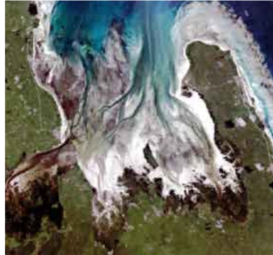
Satellite image of Chwaka Bay, Zanzibar, Tanzania.

seagrass beds (Gullström et al. 2006). It should be remembered that extensive ground-truthing is necessary for verifying all remote mapping data (Duarte and Kirkman 2001).