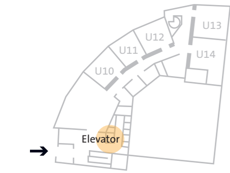
House U main entrance